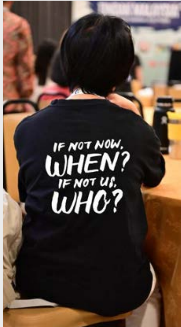
Note: The T-shirt is from Rise of Social Effort (ROSE), captured during our 2025 major event.

We would like to thank our allies and partners throughout our years in existence: Bersih, Engage, Sinar Project, MyPJ, Global Bersih, IThirdMedia Movement, Gabungan Bertindak Malaysia, Rise of Social Efforts (ROSE), International IDEA, Perludem, Parliament of Malaysia, PSSC on Human Rights, Election and Institutional Reform, Universiti Malaya Constitutional Team and all the Tindak Malaysia's former and current volunteers.