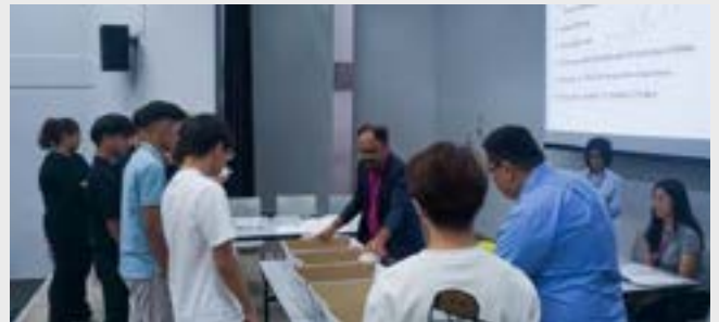
Voter Education organized in Taylor University in collaboration with Taylor's Law Society.