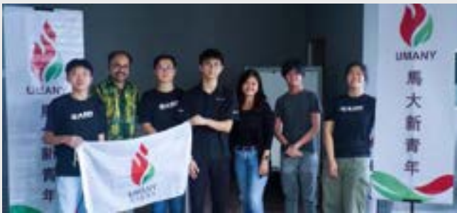
Voter Education organized in University of Malaya in collaboration with UMANY