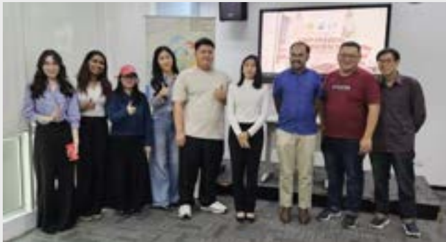
Voter Education organized in Brickfields Asia College in collaboration with ALSA Brickfields Asia College.