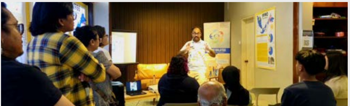
Tindak Malaysia election poster exhibit event in collaboration with MANDIRI and Freedom Film Fest,