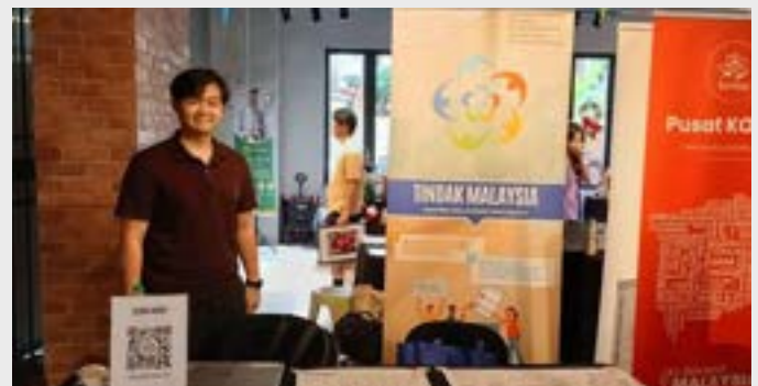
Tindak Malaysia participation in 2025 Malaysia Bar's Human Rights Festival